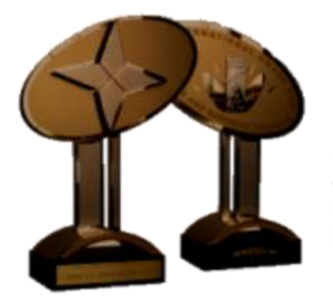
Diamond Award for Excellence and Bussiness Prestige New York 2006